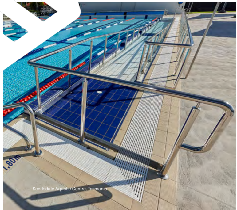
Scottsdale Aquatic Centre, Tasmania