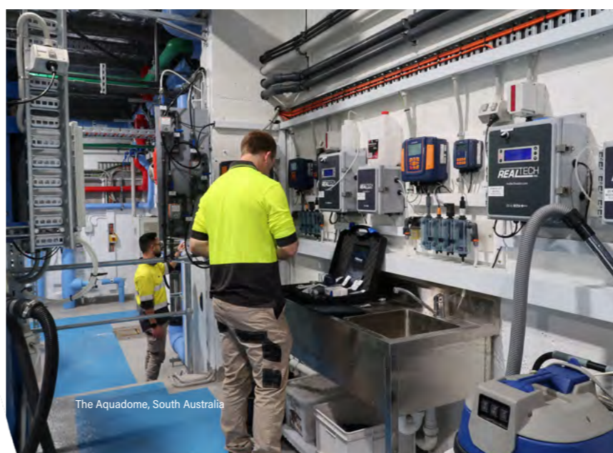
The Aquadome, South Australia