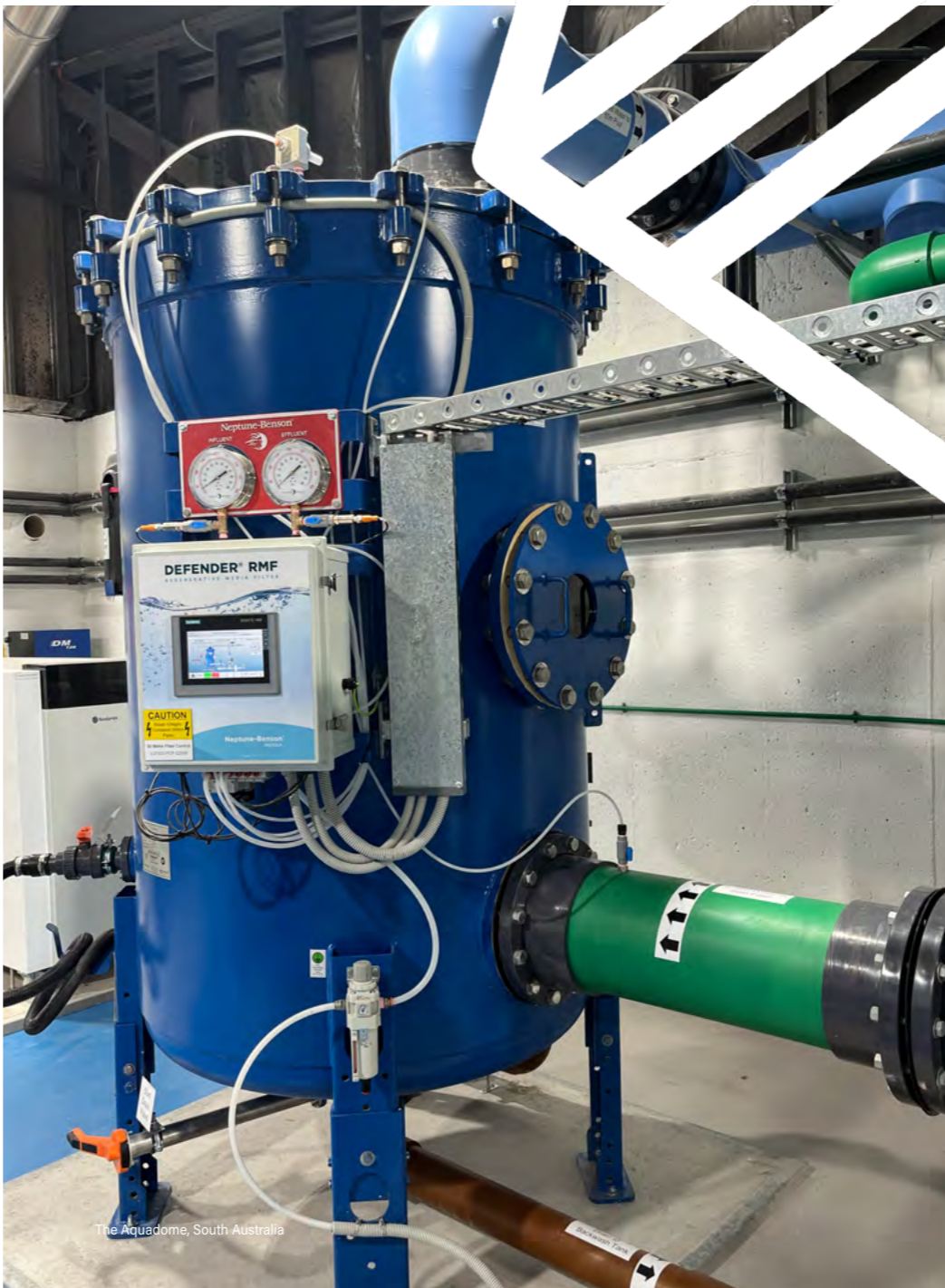
The Aquadome, South Australia