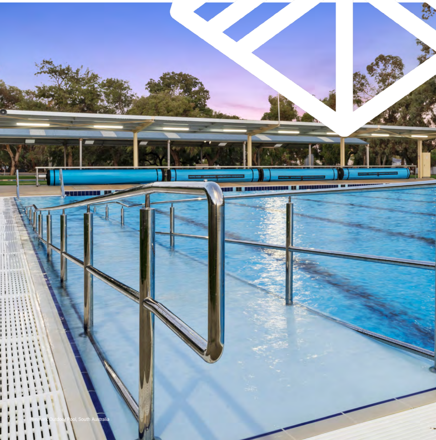
Benchmark Outdoor Pool, South Australia