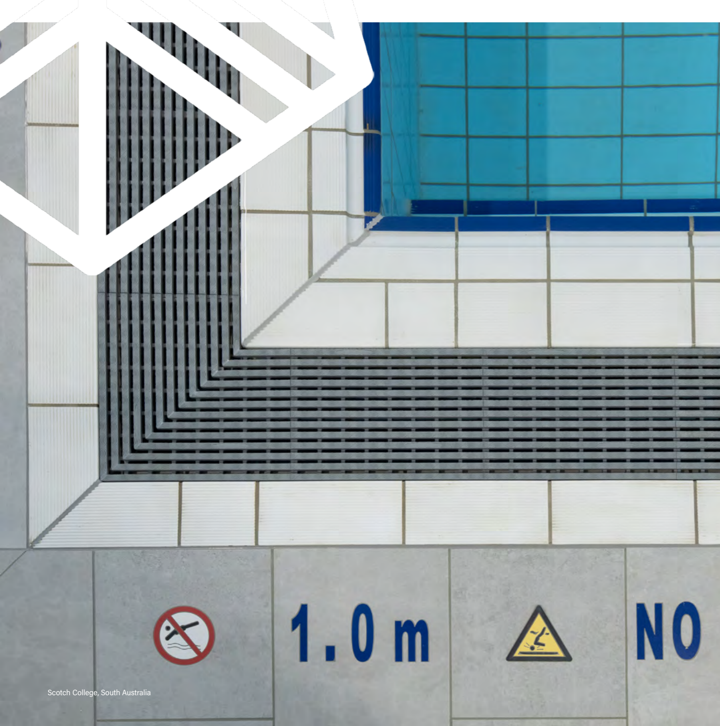
Scotch College, South Australia