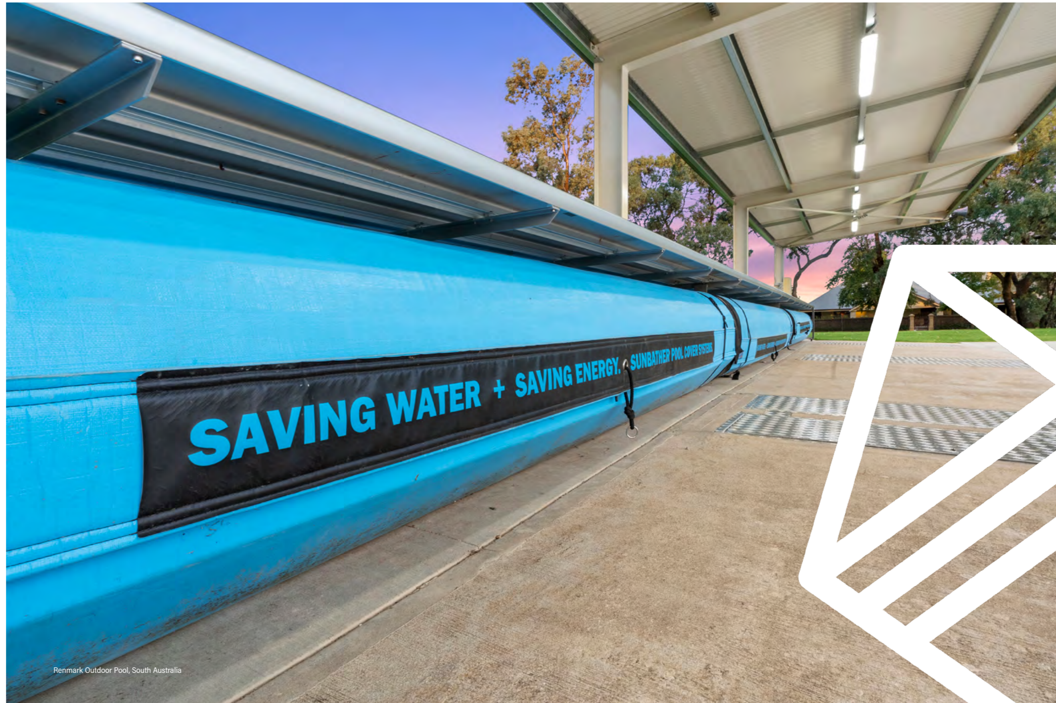
Renmark Outdoor Pool, South Australia

Innovations in hard, slat covers are an additional option for smaller pools in hospitality or other public locations.