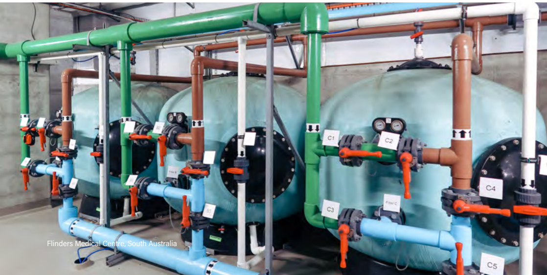
Flinders Medical Centre, South Australia