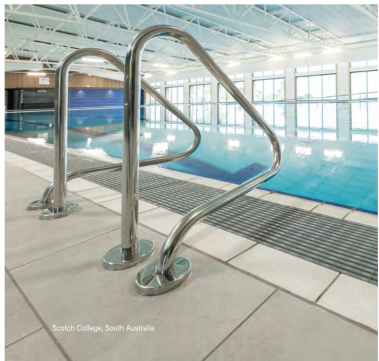
Scotch College, South Australia