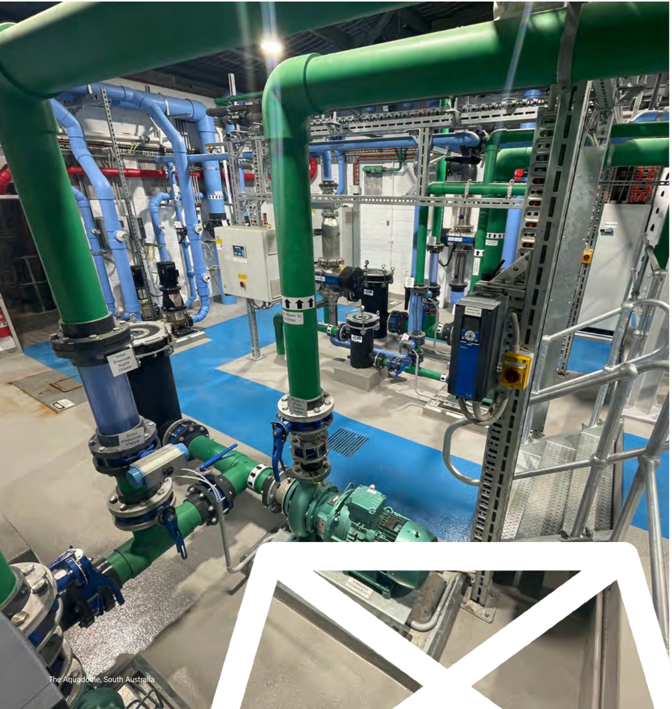
The Aquadome, South Australia