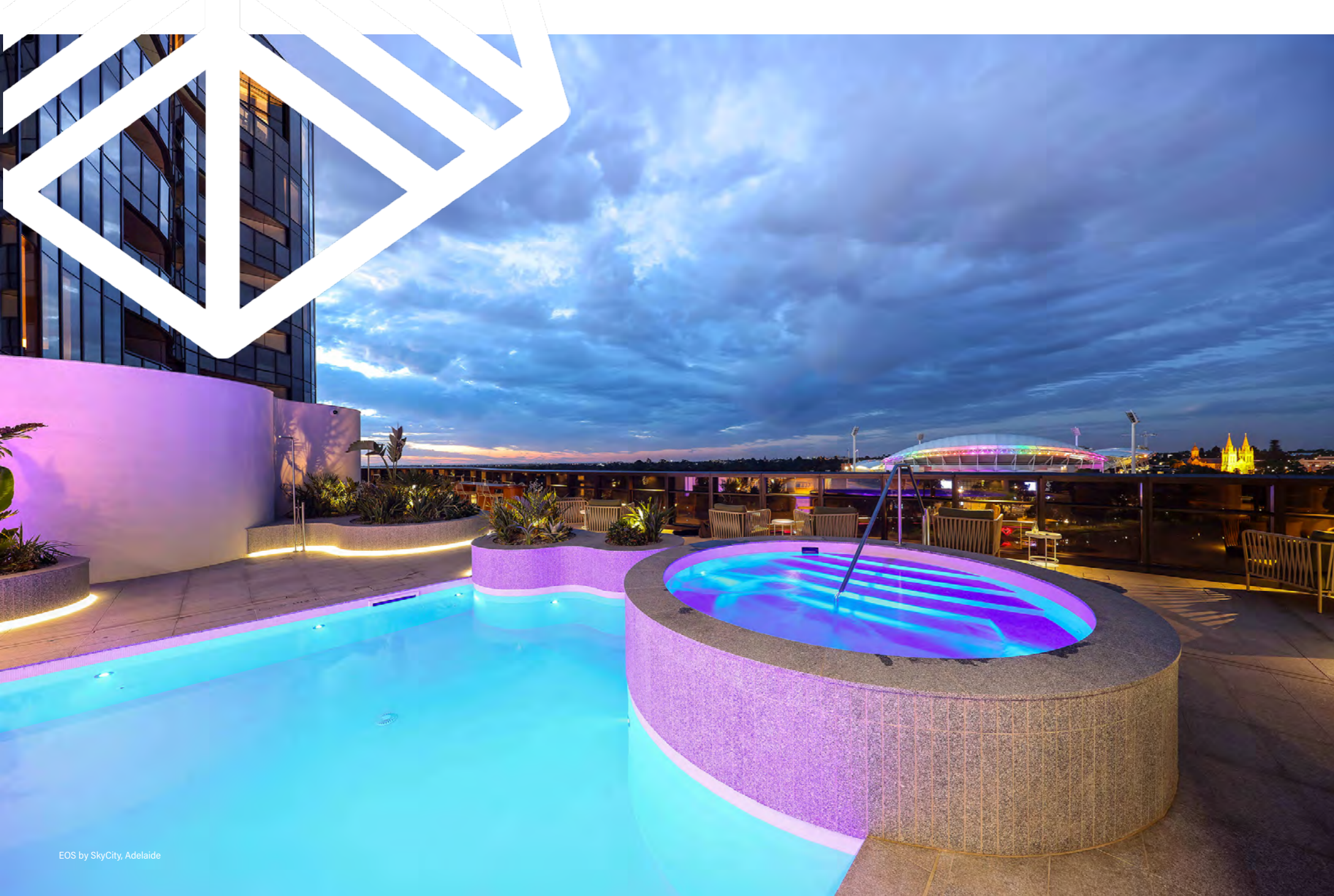
EOS by SkyCity, Adelaide