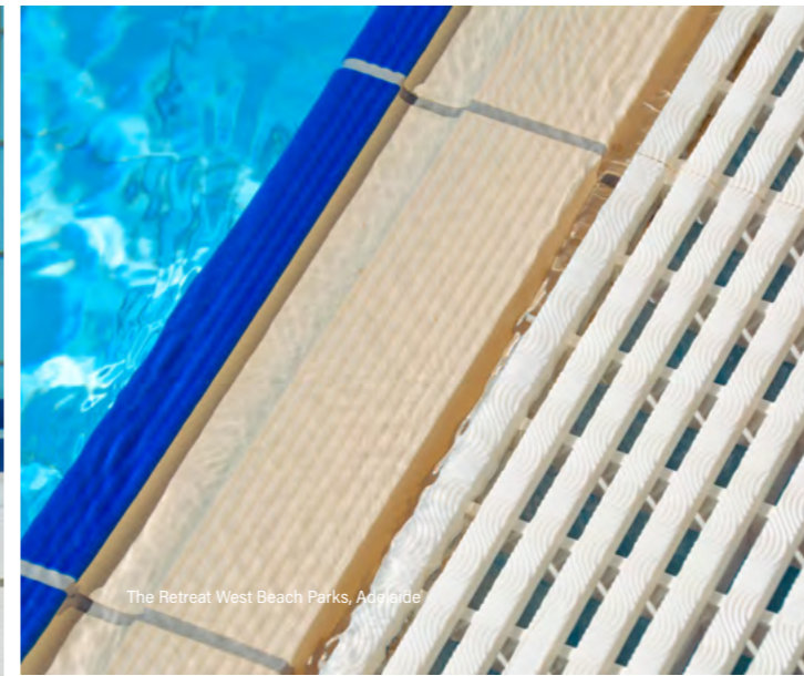
The Retreat West Beach Parks, Adelaide