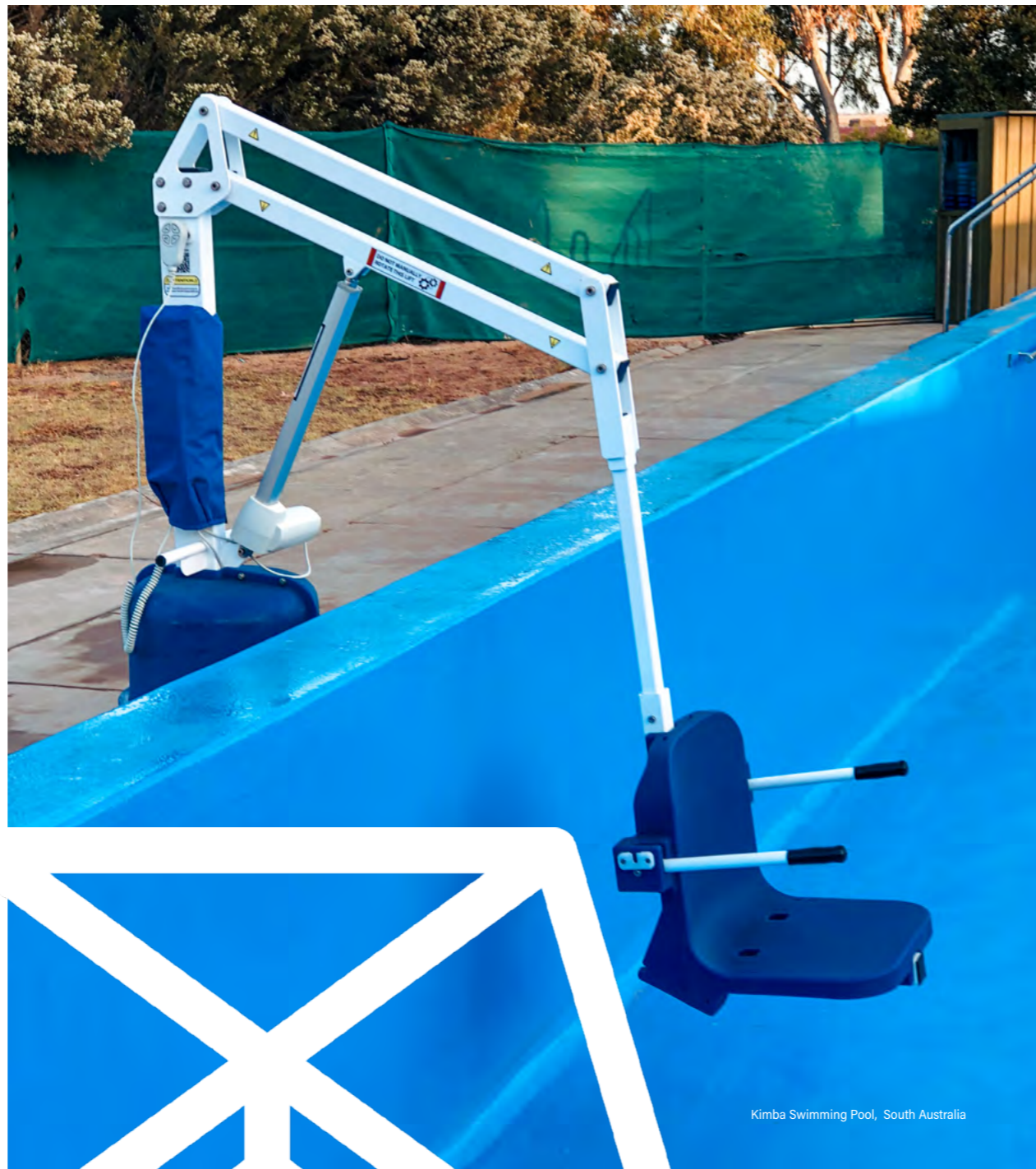
Kimba Swimming Pool, South Australia