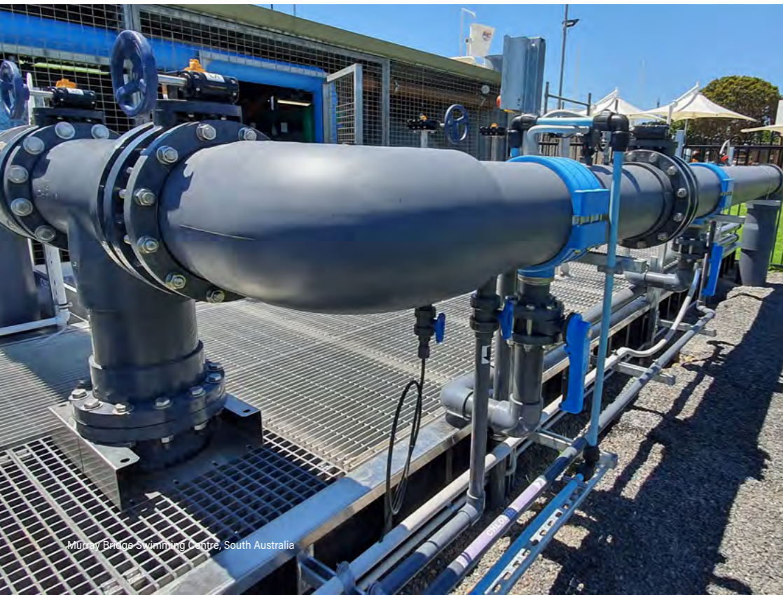
Murrey Bridge Swimming Centre, South Australia