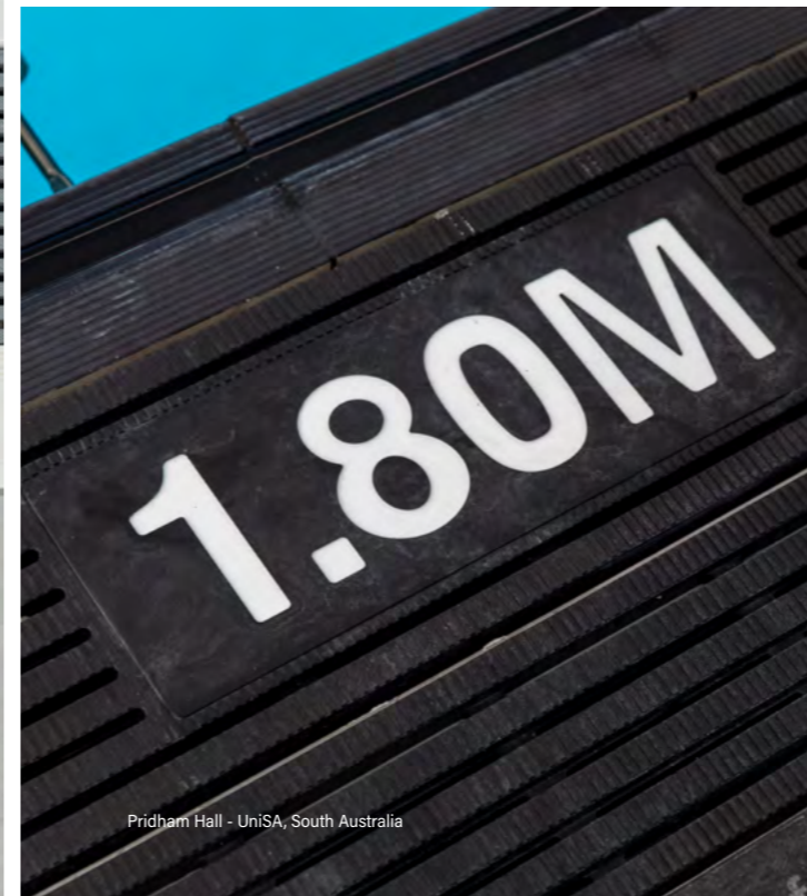
Pridham Hall - UniSA, South Australia